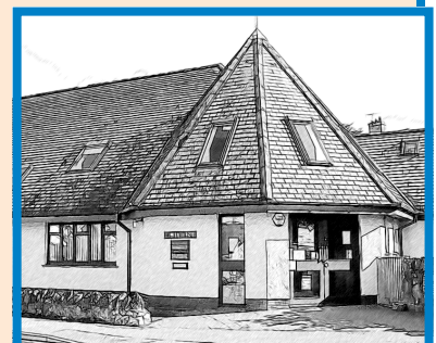
Tower House Surgery, Chudleigh